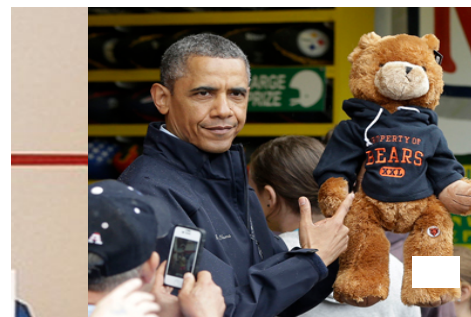
Raw: Christie Wins Obama a Stuffed Bear