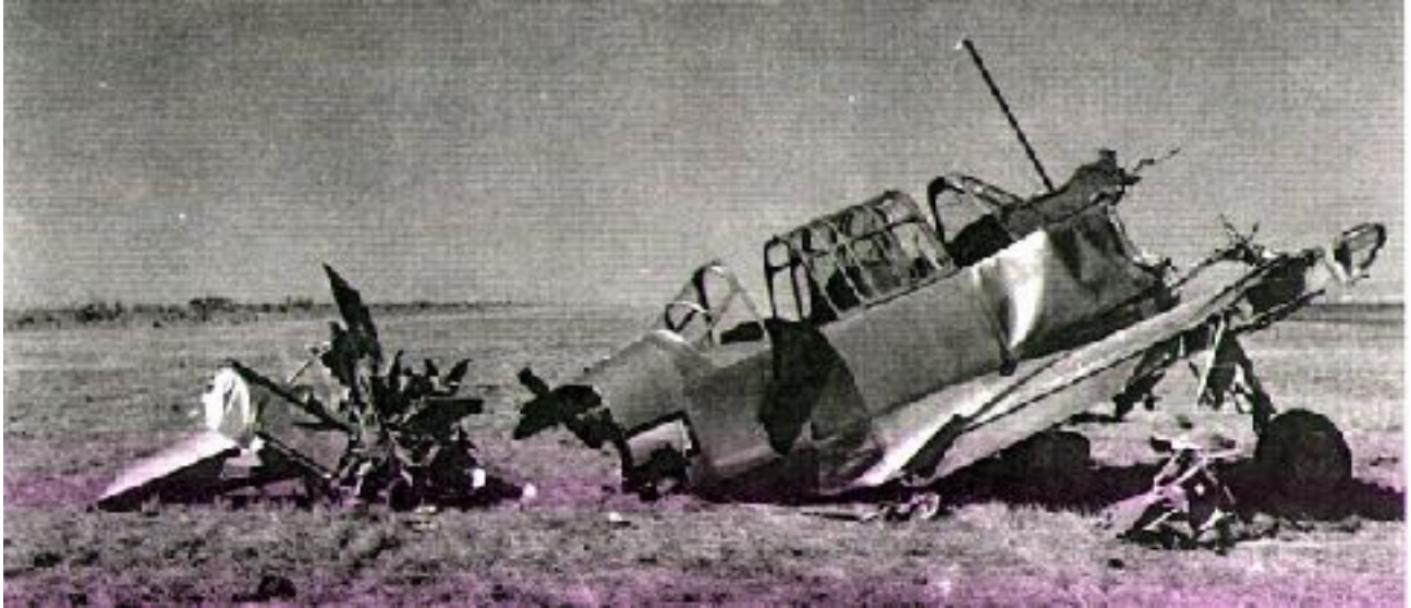
BT-13 after cartwheeling during landing at Biggs AAB.

Kay had finished an instrument training flight at Biggs with an instructor and the instructor was attempting to land when the plane cartwheeled off the runway. The instructor suffered a broken nose and Kay had only minor injuries, but the plane was a total loss. More pictures here: http://www.wwii-women-pilots.org/uploads/4/4/5/2/44527045/kbrick43-3_biggs_6-14-44.pdf .