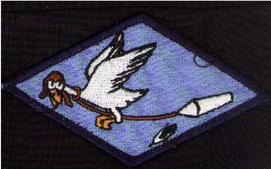
Alexander the Swoose - Replica of 6th Tow Target Patch - Courtesy Rudy Reyes (Note: In 1941, a song titled Alexander the Swoose was written.)

Based on the duty description in Granger's On Final Approach, this assignment was the most dynamic of all the duty stations for the WASP. They simulated troop strafing, flew at night for search light training, towed targets at different altitudes depending on the weapon used, flew as targets for radar tracking, flew PQ-8 radio control for target practice, flew low altitude night missions without lights to drop flares on troop trainees, laid smoke and tear gas on trainees, and occasional ferrying.