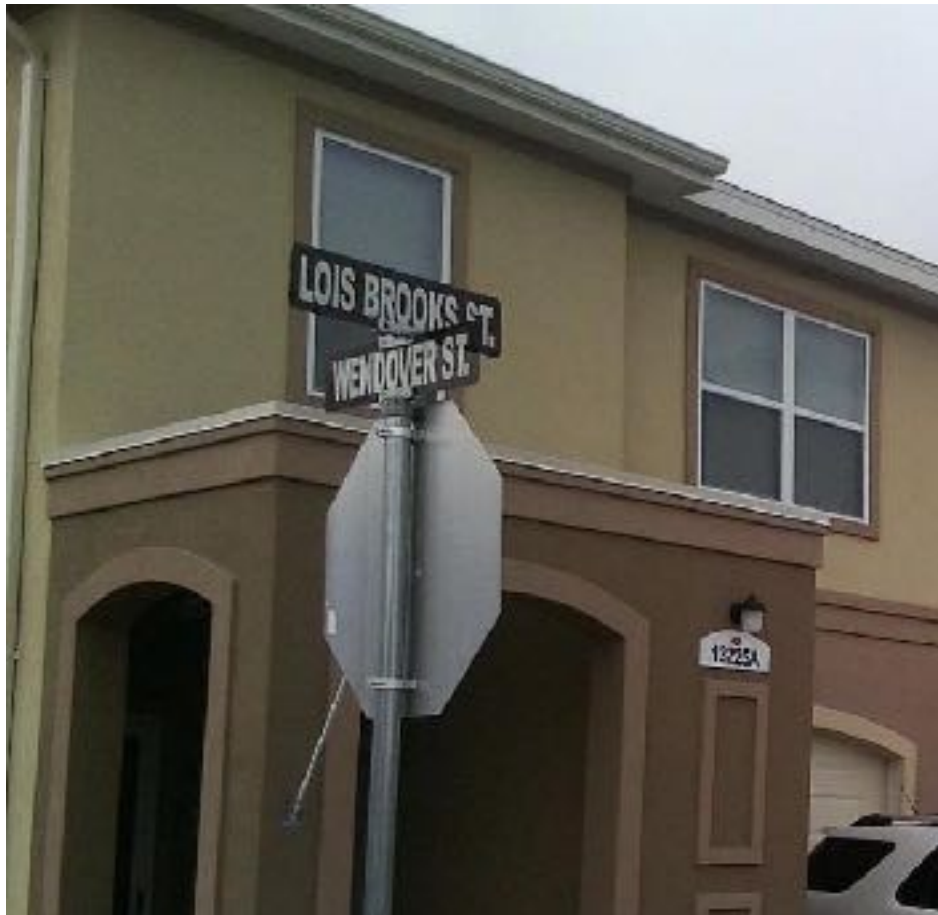
Lois Brooks St. Fort Bliss, El Paso, TX

In honor of these 26 WASP of the 6th Tow Target Squadron, and along with a long-term build up at Fort Bliss, including new base housing, streets will be named after these 26 WASP.