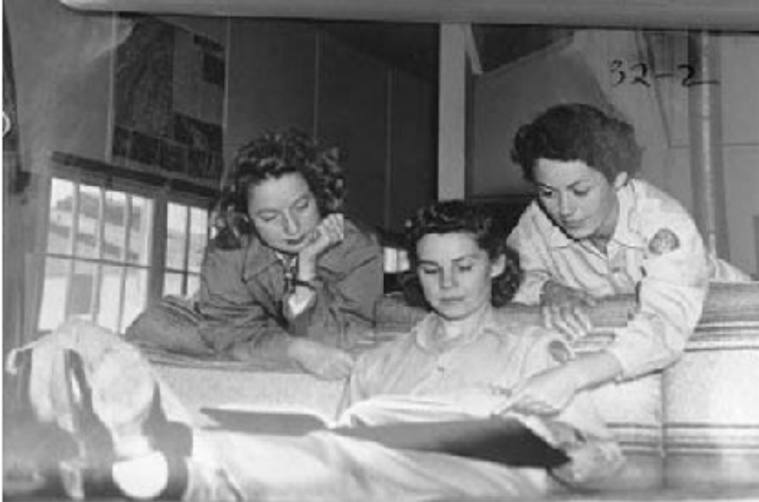
Long Beach AAB, Long Beach, California.

During the transfer to exclusively pursuit ferrying, Beatrice Medes was transferred to ATC/FD headquarters to a desk job. [1, pages 346-348], [4, page 344]