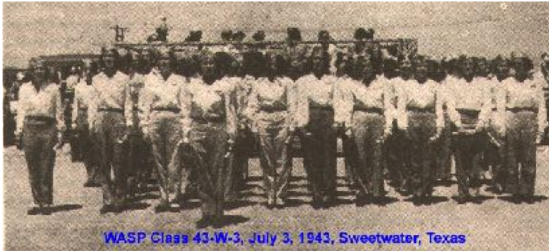
Class 43-3 Graduation

This issue was extended after the move by unusual weather in Sweetwater - two weeks of rain. [3 page 97-98] On July 3, 38 of the 58 graduated.