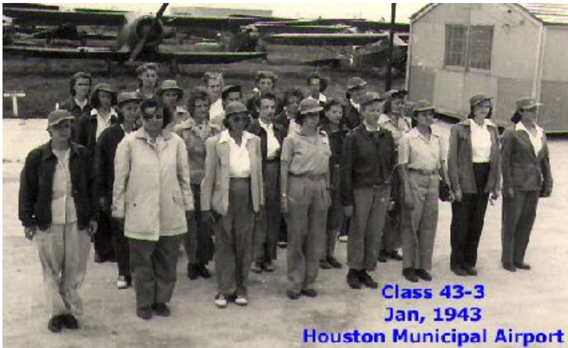
Half of Class 43-3

Unless otherwise noted, my primary reference for this article is On Final Approach [1] by Byrd Howell Granger of class 43-1. It is full of stories, pictures, lots of lists (Including all the Army bases and who was assigned to them), charts, and tables. Also included are photos taken by my mother and from the TWU library. I also used Out of the Blue and Into History (43-3 biographies) [2], WASP of the Ferry Command [3], Sisters in the Sky, Vol II [4], and View from the Doghouse of the 319th AAFWFTD [5].